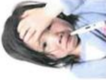
Cold & Flu