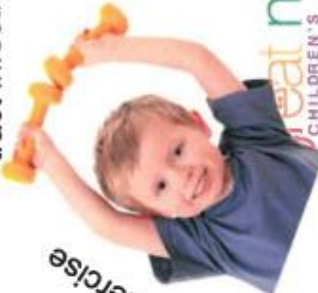
Especially in cold/damp air