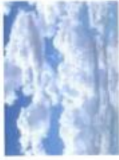
Change in weather