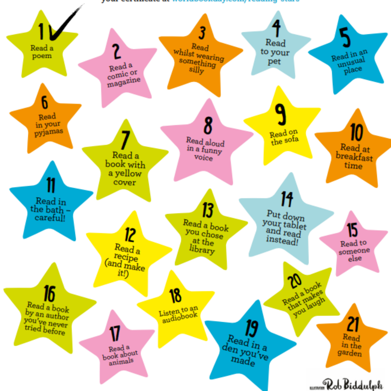
Illustration Rob Biddulph

Tick off a Reading Star each time you complete a reading task and have fun reaching all your stars! You can also play the game online and download your certificate at worldbookday.com/reading-stars